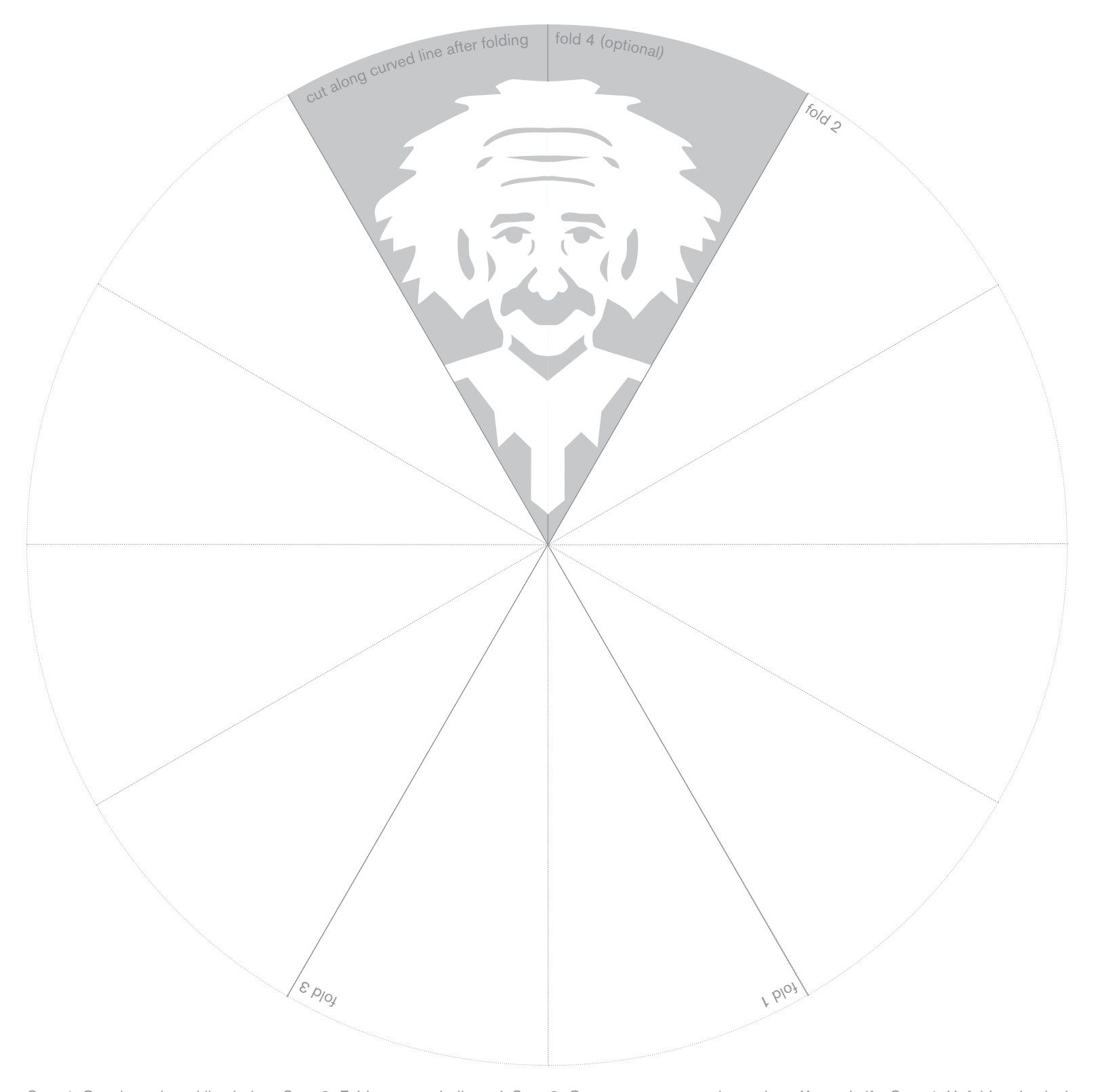
Step 1: Cut along dotted line below. Step 2: Fold paper as indicated. Step 3: Cut out gray areas using a sharp X-acto knife. Step 4: Unfold and enjoy!